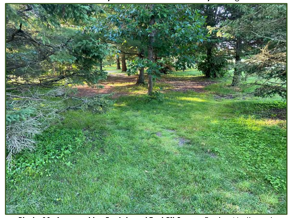
Photo 11: Assessed by 5m Interval Test Pit Survey Facing North-east