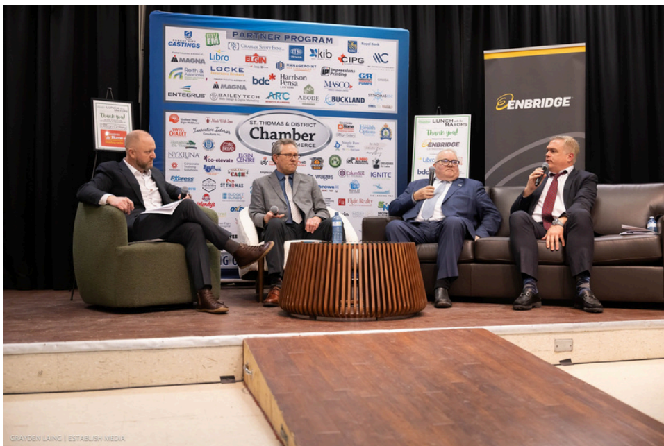
2026 Lunch with Mayors