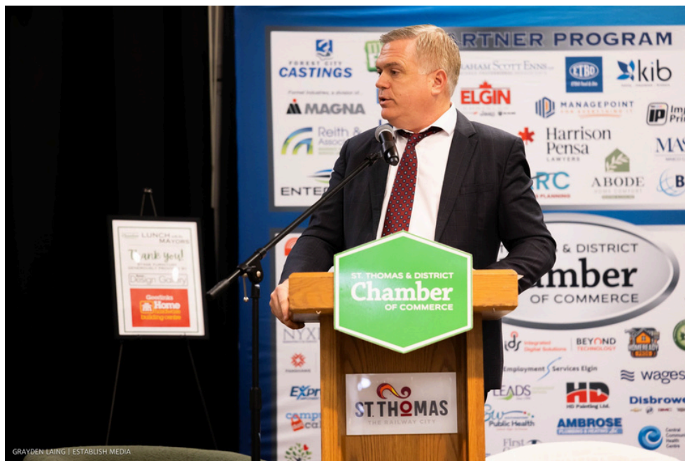
2026 Lunch with the Mayors