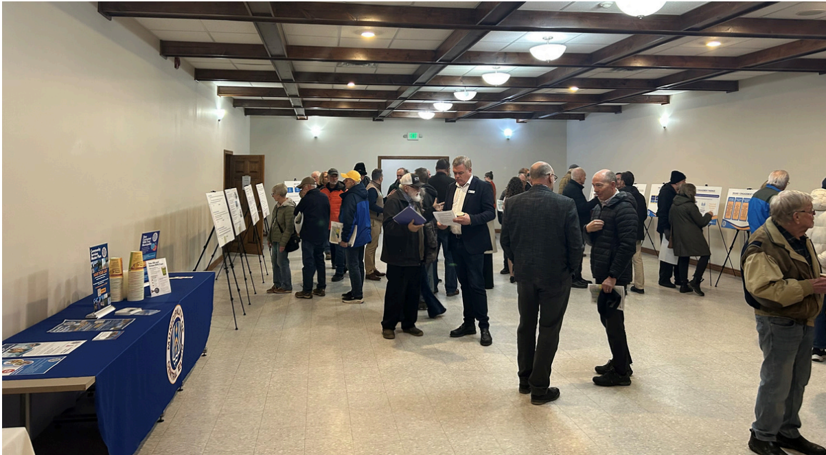
Hospital Lands Public Open House