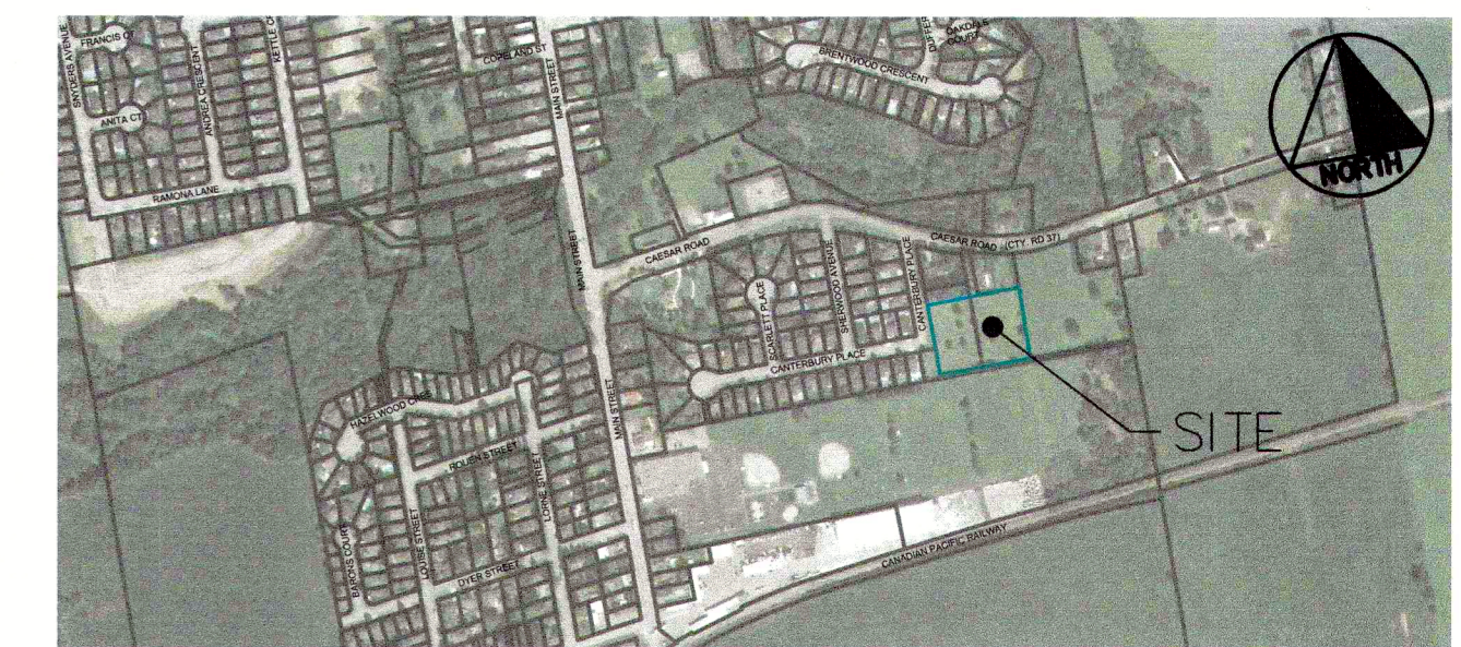
KEYPLAN SCALE: 1:10,000

I:\ACAD Projects\2020\20048\01-Model\20048-Draft Plan\20048-Draft Plan.dwg, 2022-02-08 9:08:28 AM, CJD\PC38