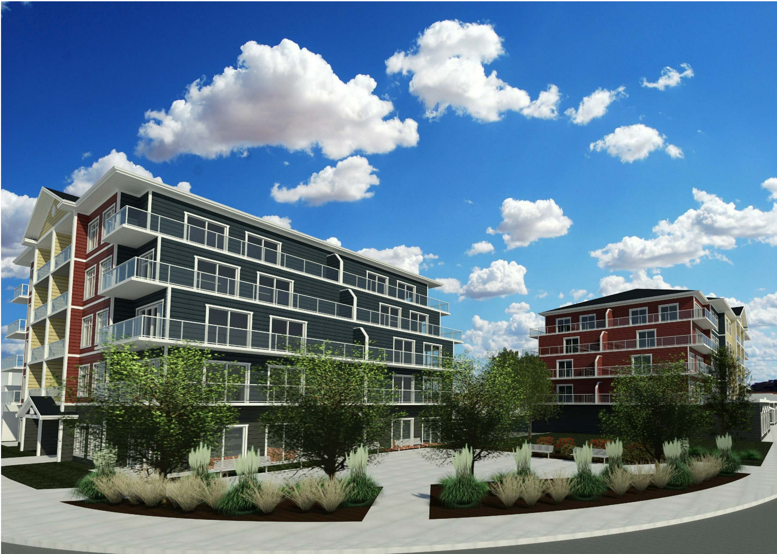
CORNER OF EDITH CAVELL BLVD. & WILLIAM STREET