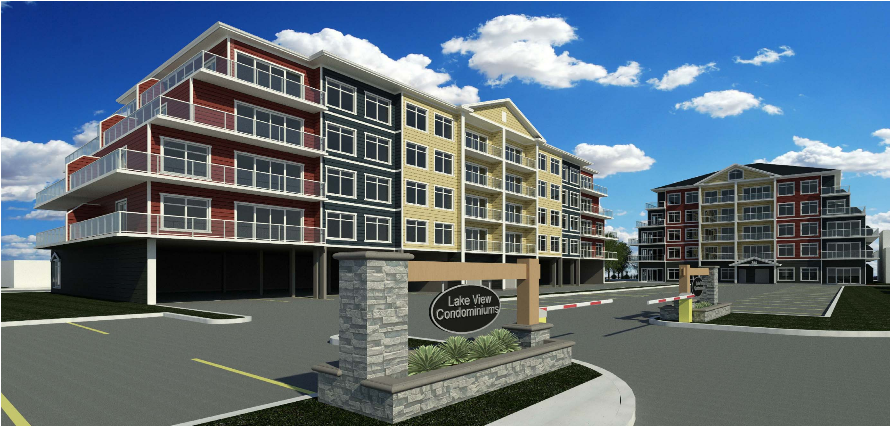
NORTH ELEVATIONS (FIRST STREET)