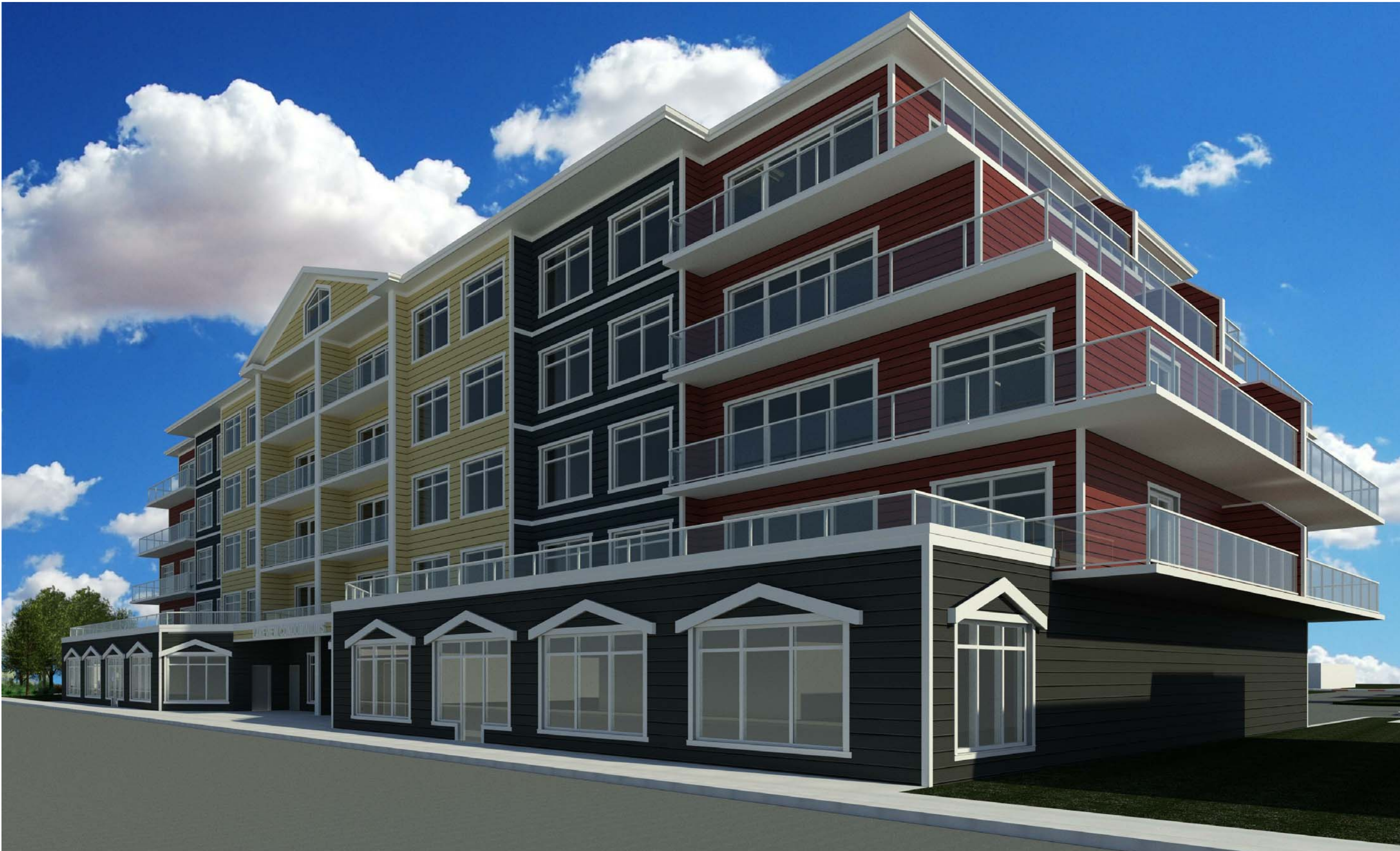
BUILDING 1 - WEST ELEVATION (WILLIAM STREET)