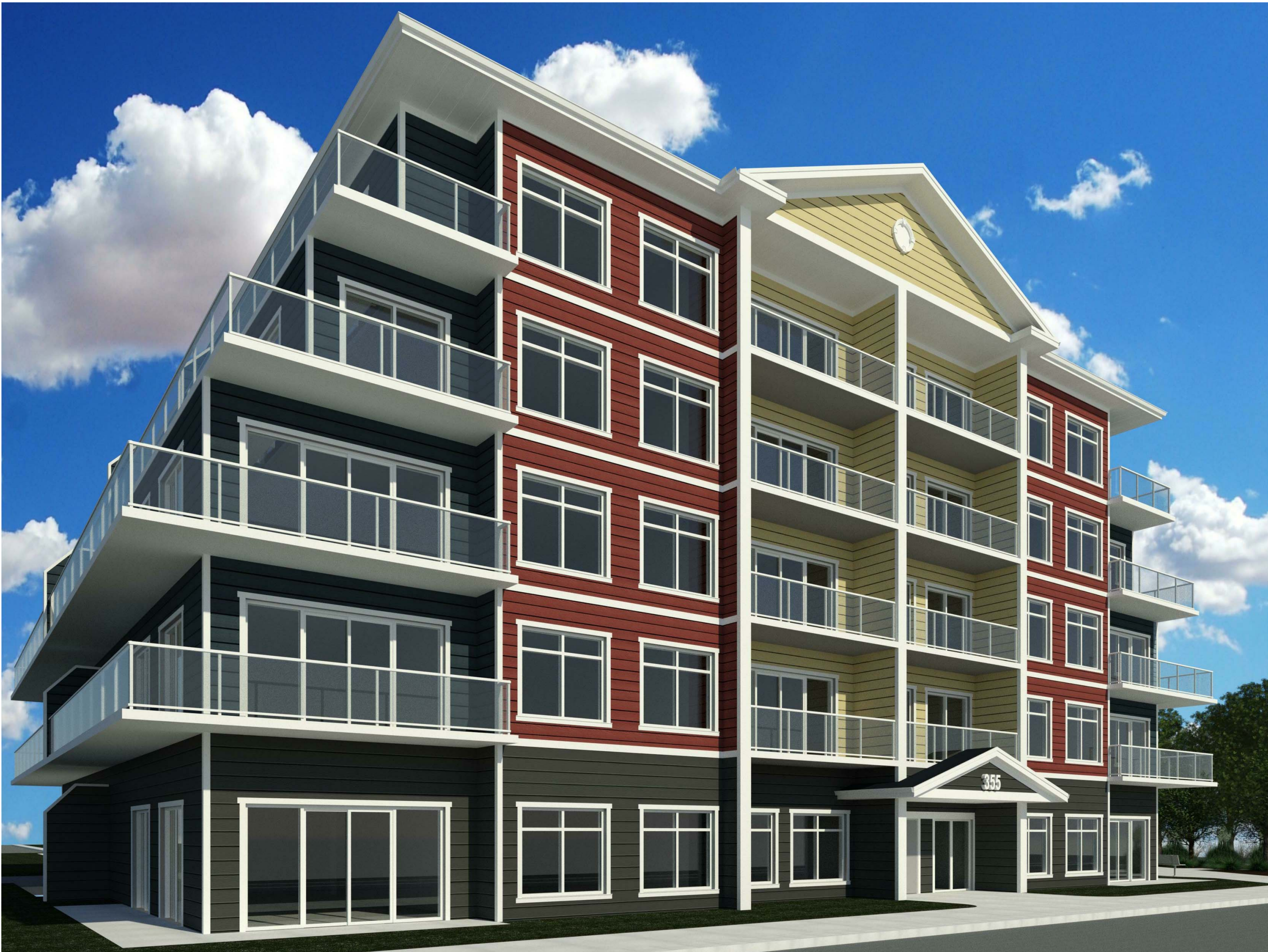
BUILDING 2 - SOUTH ELEVATION (EDITH CAVELL BLVD.)