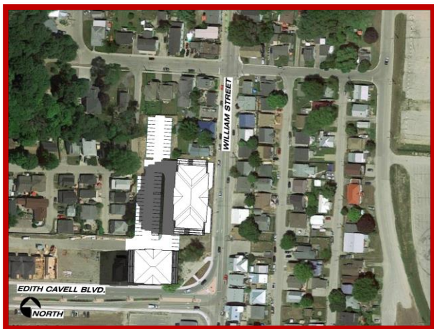
Summer Solstice - June 21 - 8am