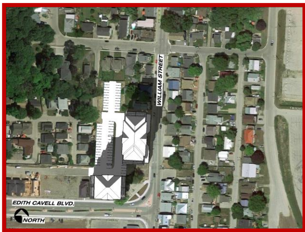
Winter Solstice - December 21 – 2pm