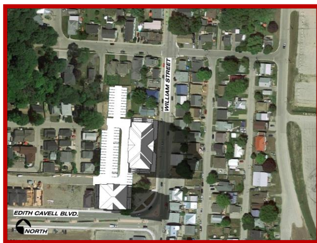
Summer Solstice - June 21 - 6pm