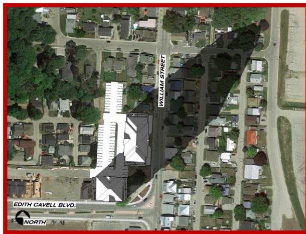
Winter Solstice - December 21 – 4pm