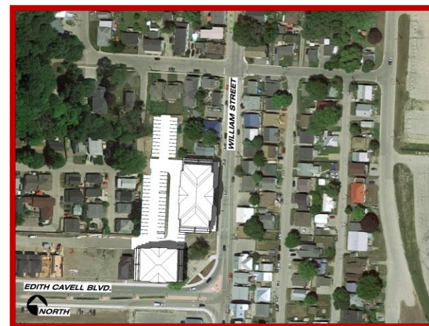
Summer Solstice - June 21 - 2pm