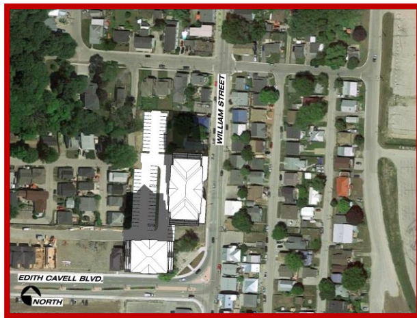
Winter Solstice - December 21 – 12pm