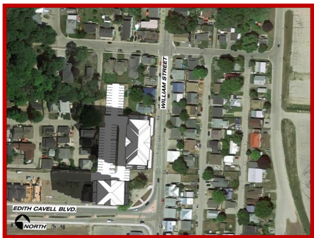
Equinox – Mar/Sept. 21 - 8am