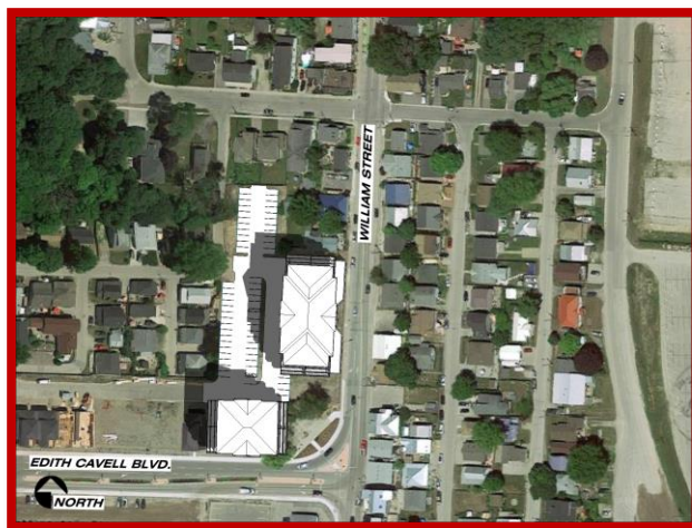
Equinox – Mar/Sept. 21 - 10am