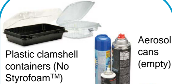
Plastic clamshell containers (No Styrofoam™)