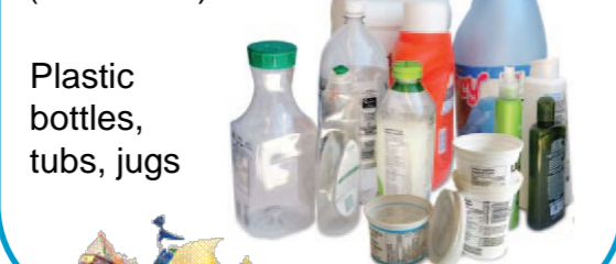
Plastic bottles, tubs, jugs