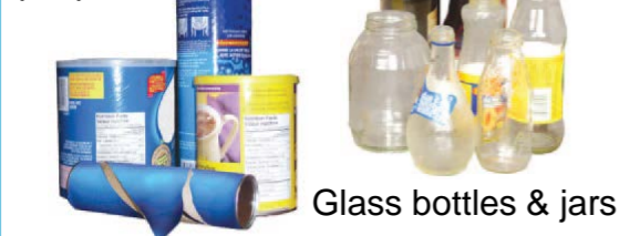
Glass bottles & jars