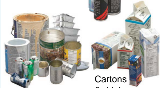
Steel & aluminum cans, metal paint cans (empty), aluminum foil and pie plates