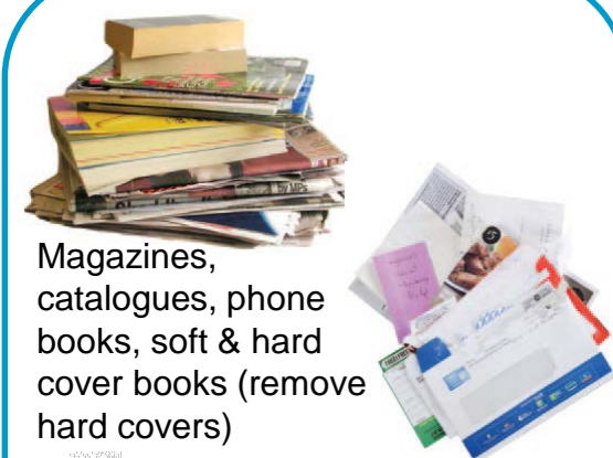
Magazines, catalogues, phone books, soft & hard cover books (remove hard covers)